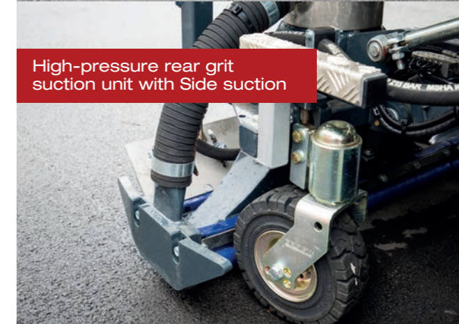
High-pressure rear grit suction unit with Side suction

Your sweeper as individual as you are - that is our strength. We find the perfect solution for your cleaning work. With a multitude of possibilities and variations, your machine becomes the ultimate cleaning professional. Please contact us or write to us: sales@brock-kehrtechnik.de